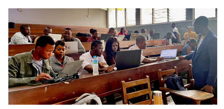
FIGURE 1. Participants, instructors, and organizers at the Python component of COESSING 2023 in Accra, Ghana.

A unique aspect of the COESSING Python component, compared to the other case studies presented here, is that it did not begin as a hackweek format. Rather, it evolved into a program that has ended up resembling a hackweek based on participant and instructor feedback. After three years with proprietary