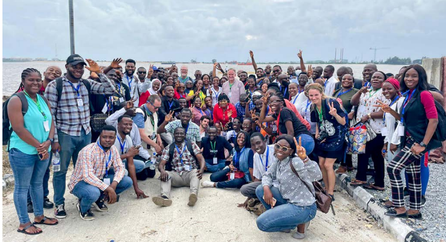
FIGURE 4. Most of the participants in the 2022 COESSING summer school in Nigeria are pictured here.

Research funding is critical for promoting international collaboration. The school began with funding that was included in