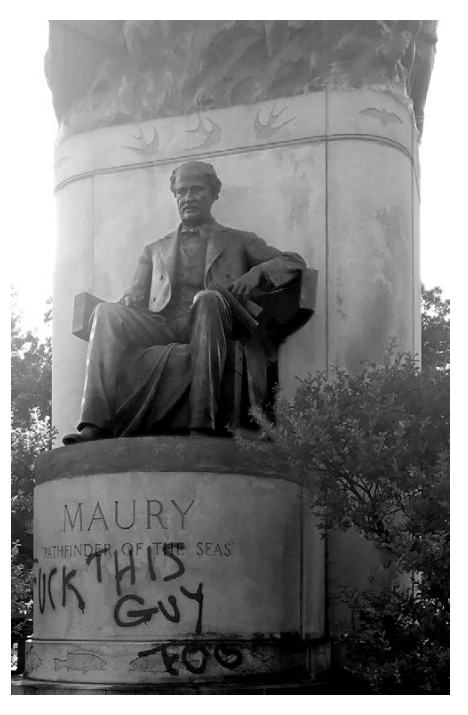
FIGURE 1. A statue of Matthew Fontaine Maury on Monument Avenue in Richmond, Virginia, was graffitied in mid-June 2020.

A Virginian transplanted at a young age to Tennessee, Maury joined the navy after hearing an older brother's sea stories. Always concerned about the lack of formal education for naval officers, Maury turned to science as a career path after a leg injury ended his hopes of command at sea. As head of the Depot of Charts and Instruments and superintendent of the new Naval Observatory, Maury applied navy resources to the development of science, particularly astronomy and hydrography. He was an early leader in the organization of meteorology and ocean science on the national and international levels. His efforts resulted in an expansive series of charts that not only shortened