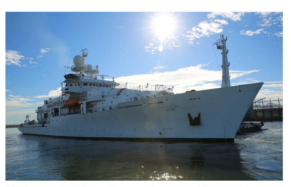
FIGURE 4. Military Sealift Command's oceanographic survey ship USNS Maury pulls into Naval Station Norfolk, Virginia, in November 2017.