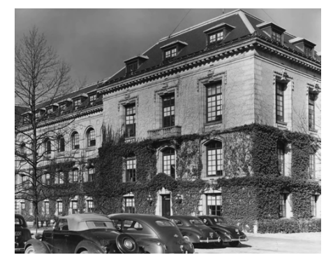
FIGURE 2. Maury Hall is located at the United States Naval Academy. The picture was taken on December 15, 1944. US Navy file photo

Maury's successful rehabilitation was also solidified into architecture, particularly that associated with education. Maryland, home state of the US Naval Academy (USNA), had been on the border during the Civil War and, in the throes of the Lost Cause ideology's success, an academic building at USNA was named for Maury (Hall, 1929; Figure 2). Honoring a former Confederate officer at the place where future American naval officers are trained symbolically welcomed him back into the fold. Recognizing Maury alongside other naval heroes on campus presented him as a role model for the midshipmen who would go on to lead future sailors and marines, especially as the twentieth century navy required an increasingly technical education. Maury's name also adorns other educationrelated buildings, including one at Fort Trumbull, in New London, Connecticut, used to train US Maritime Service officers during World War II; a hall at James Madison University, in Harrisonburg, Virginia; and a high school in the erstwhile Confederate port of Norfolk, Virginia, among others (WHSV, 2020; Gregory, 2020).