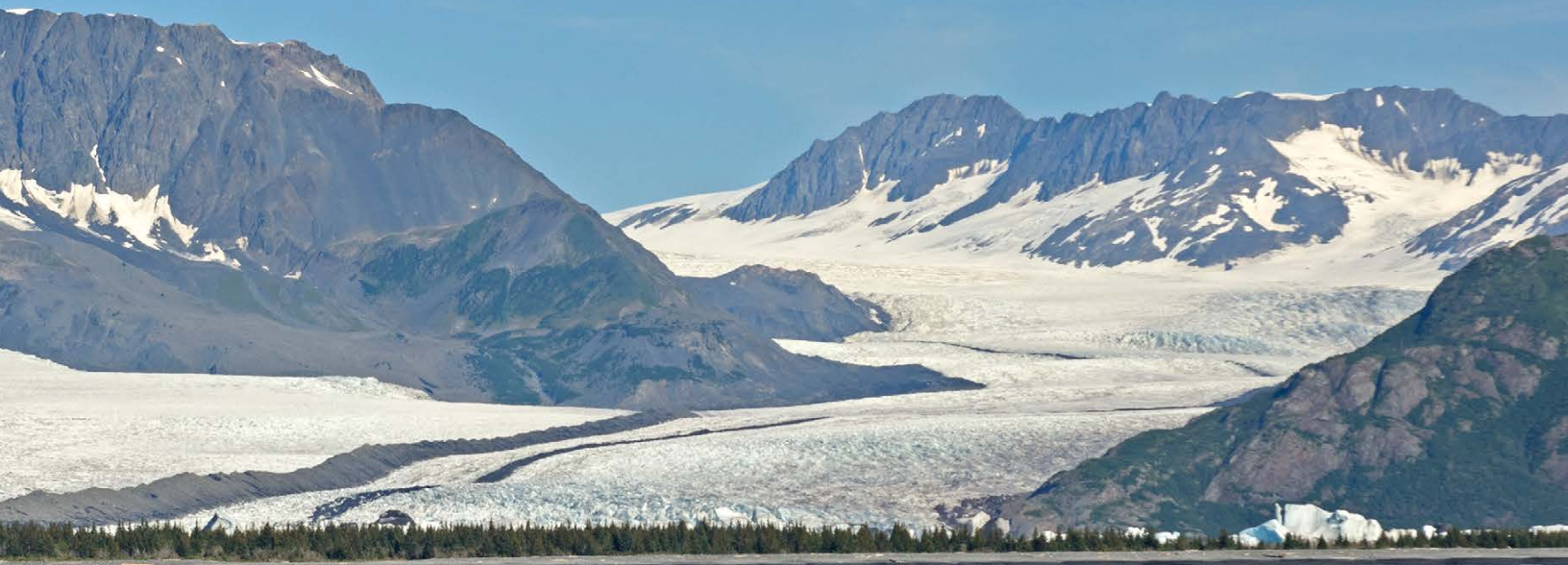
Bear Glacier flowing into the Gulf of Alaska at the mouth of Resurrection Bay near Seward, Alaska.