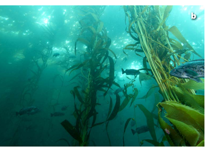
FIGURE 2. Monitoring and research in rocky intertidal and kelp forest habitats of the California Current Large Marine Ecosystem. PISCO programs study biogeographic patterns of the structure and function of these important ecosystems through quantification of macroalgae, invertebrates, and fishes. Research approaches allow quantification of large- and small-scale spatial patterns in the biological communities and characterization of changes over time. Ongoing oceanographic work provides information about environmental variables,

using, for example, moorings, bottom-mounted sensors, and autonomous vehicles. Data collected provide insight into the causes and consequences of ecosystem changes resulting from natural and anthropogenic drivers. (a) Macroalgal-dominated Fogarty Creek, Oregon, is one of PISCO's long-term monitoring and research sites. Rocky intertidal reefs are important testing grounds and experimental "laboratories" for ecologists worldwide because of their accessibility, steep environmental gradients, and relatively rapid turnover of organisms living there. (b) A typical central California kelp forest community shot taken at approximately 12 m depth near Pebble Beach. Kelp forests of the eastern Pacific coast are dominated by two canopy-forming, highly productive brown macroalgal species—giant kelp, Macrocystis pyrifera , and bull kelp, Nereocystis luetkeana . These forests are home to a high diversity of fishes, invertebrates, and other algae, including economically important species such as sea urchins, abalone, lobster, rockfishes, and other finfishes.