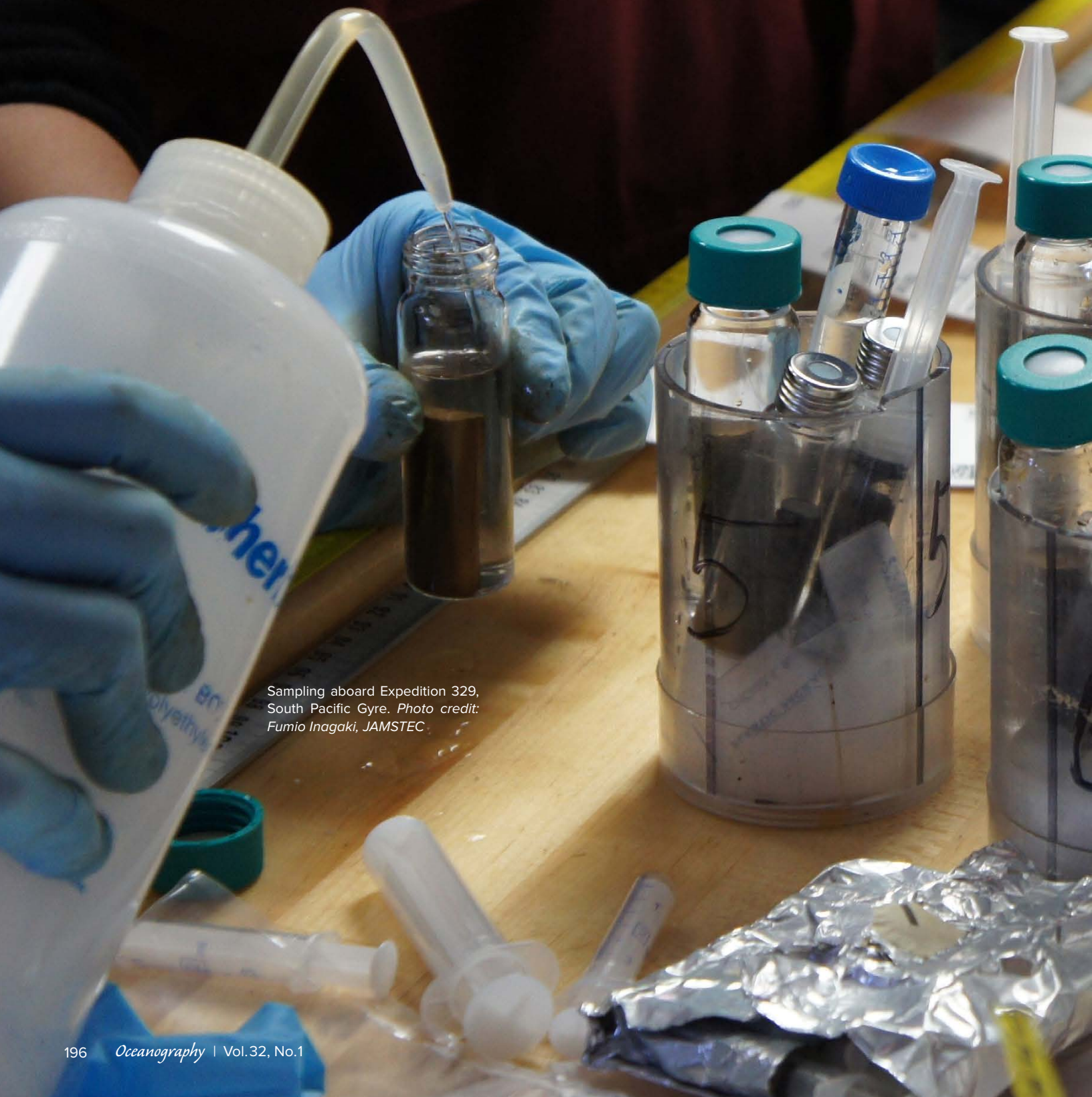
Sampling aboard Expedition 329, South Pacific Gyre.