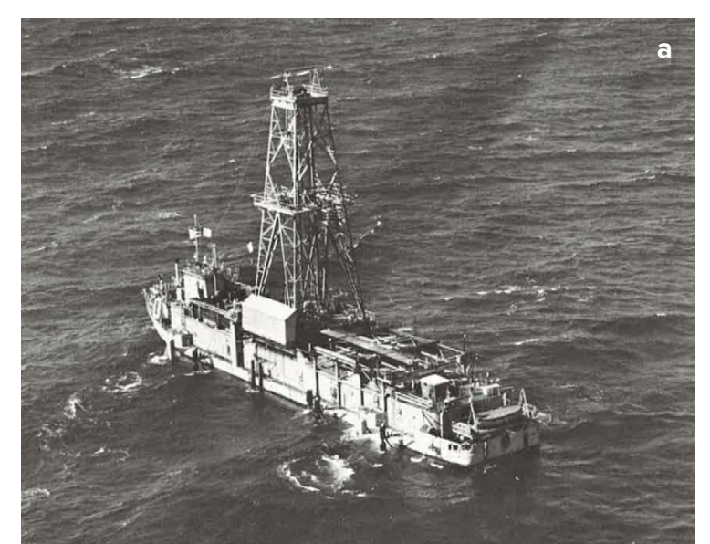
FIGURE 1. (a) The drilling vessel CUSS I as used during phase 1 of Project Mohole. (b) A first examination of cores onboard ship during Project Mohole.

drilling barge CUSS I (Figure 1a), to which four large outboard motors had been added so it could operate as the first dynamically positioned drilling vessel in the world (Bascom, 1961). In a successful demonstration, phase I cored 170 m of sediments and 13 m of underlying basalt at a deepwater site offshore Baja California (Figure 1b). Huge public interest developed, thanks to a prominent article by the famous novelist John Steinbeck in Life magazine (Steinbeck, 1961). Recovering subseafloor basalt was a major scientific accomplishment at the time, so much so that it inspired a congratulatory telegram from US President John F. Kennedy