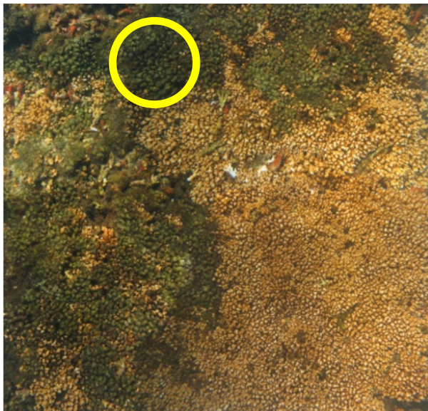
Dead coral overgrown by green algae