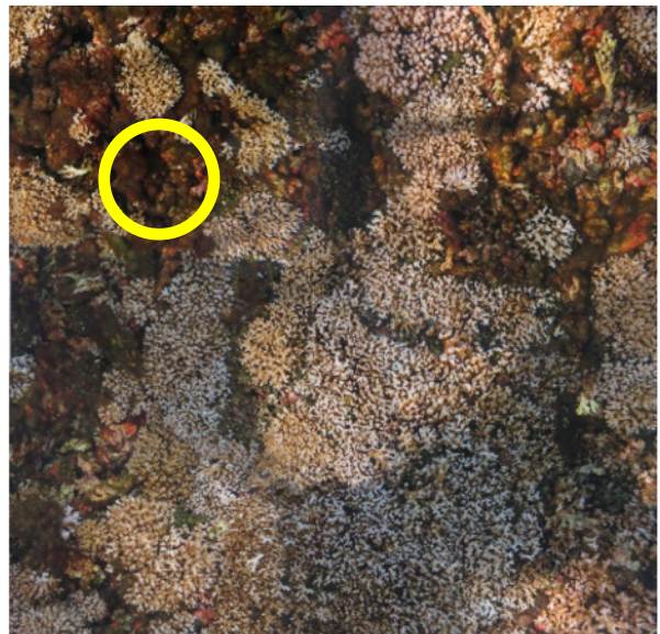
Dead coral overgrown by red algae