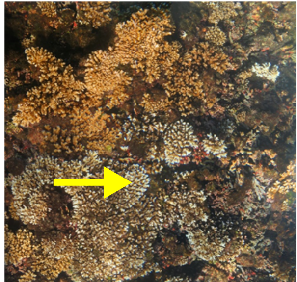
Live coral with white tips