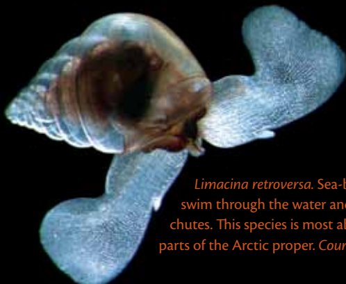
Limacina retroversa . Sea-butterflies, or pteropods, are pelagic snails that swim through the water and catch food on sticky mucus webs and parachutes. This species is most abundant in the subarctic Atlantic, and adjoining parts of the Arctic proper.

The revelation that the same species dwell at both the north and south poles tells us that despite an 11,000-km-separation, they—and we—are all citizens of one Earth.