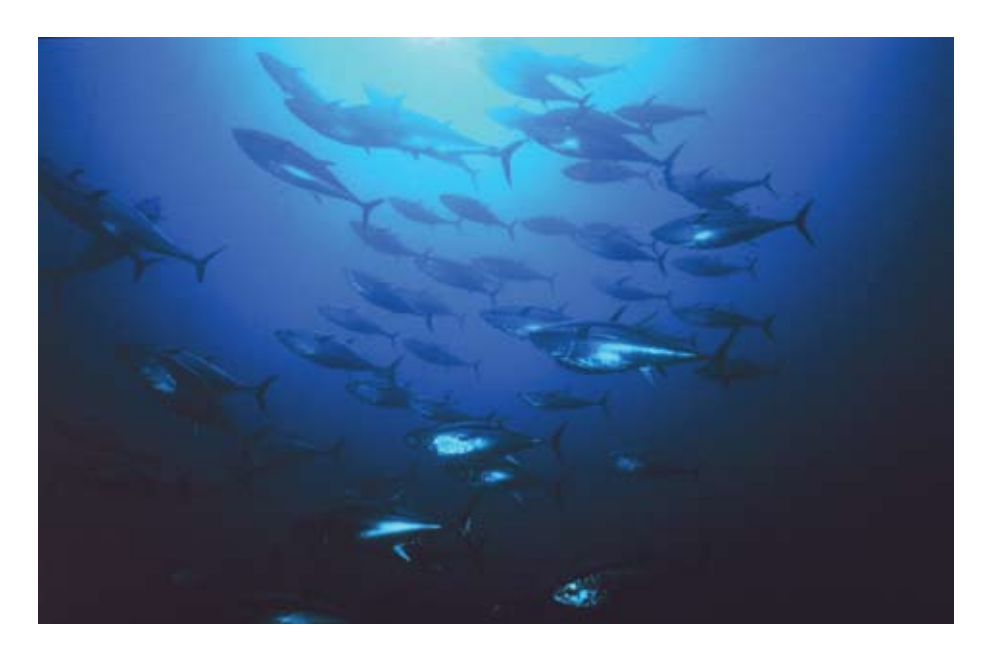
Figure 3. Tunas and other pelagic species will aggregate around drifting or moored objects as they do around "fish aggregating devices," locally changing the nature of pelagic habitat.