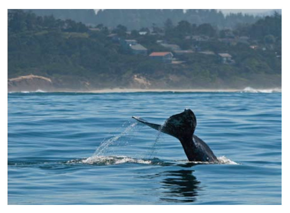
Figure 5. Gray whales ( Eschrichtius robustus ) migrate along the west coast of North America, often within the depth zones where wave energy is proposed for development. The behavioral response of marine mammals to OREDs is an area of high uncertainty. Craig Hayslip, OSU Marine Mammal Institute

are primary concerns. Blade strike in the case of ocean current or tidal devices may also be of concern (Wilson et al., 2007). For those devices with cables and moorings, the nature of mooring cables (slack or taut, horizontal or vertical, diameter) is critical to entanglement issues. Should fish and invertebrates be concentrated around devices as predicted, both cetaceans and pinnipeds could be attracted by the feeding opportunity (as has been suggested in studies around Danish wind farms once construction has ceased; DONG Energy et al., 2006), thereby increasing the likelihood of impact. Special attention should be paid to migratory routes or special feeding grounds. In the case of gray whales along the Pacific coast of North America, the migration along the coast passes through optimal regions for wave energy device deployment (Herzing