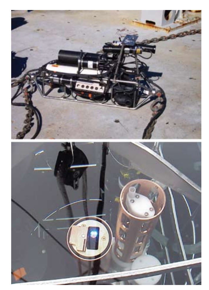
Figure 3. (Top) Optical package used for measuring several inherent and apparent optical properties during the MOSEAN field trials. (Bottom) The WET Labs water quality monitoring (WQM) optical measurement system equipped with special anti-biofouling devices.

Another component of the O-SCOPE project focused on developing bio-optical sensors with improved stability and endurance for operational monitoring and research (Figure 3). These efforts led to the development of modular bio-optical sensor suites for long-term (months to a year or more) and sustained sampling in open and coastal ocean environments (Casey Moore, WET Labs Inc.). The sensor suite included two new open- (or flat-) faced sensors: a chlorophyll fluorometer and a multi-angle scattering sensor for measuring the volume scattering function (VSF) (Moore et al., 2000). Chlorophyll a is used as a proxy for phytoplankton biomass; the fluorometric measurement of chlorophyll a is based on excitation of the pigment in the blue to blue-green portion of the