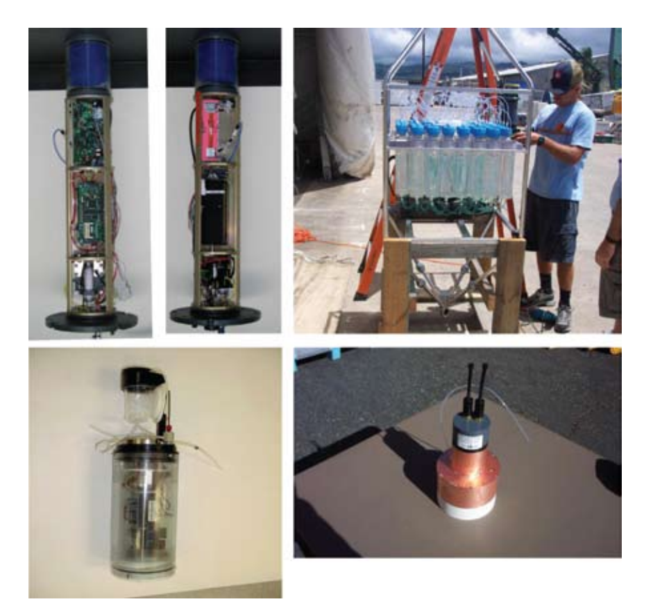
Figure 2. Chemical measurement systems used during the NOPP O-SCOPE and MOSEAN programs. (Upper left) Two views of the MAPCO<sub>2</sub> system that was deployed from the MOSEAN H-A buoy. (Upper right) The Remote Access Samplers (RAS) system deployed from the MOSEAN H-A buoy. (Lower left) The Spectrophotometric Elemental Analysis System (SEAS), which was deployed from the NOAA tsunami mooring. (Lower right) The SubChem phosphate analyzer deployed from the MOSEAN CHARM mooring.

discussed.). The current version of SEAS (SEAS II) is capable of measuring both absorbance and fluorescence, SEAS I and SEAS II have been used for in situ quantification of seawater pH (Liu et al., 2006) and nutrients (Adornato et al., 2007). The system autonomously mixes seawater and reagents, and records absorbances at user-defined wavelengths. SEAS II measurements can be obtained using liquid core waveguides or a conventional spectrophotometric cell. The use of liquid core waveguides with long path lengths provides low nanomolar detection limits for a variety of analytes (Adornato et al., 2005).