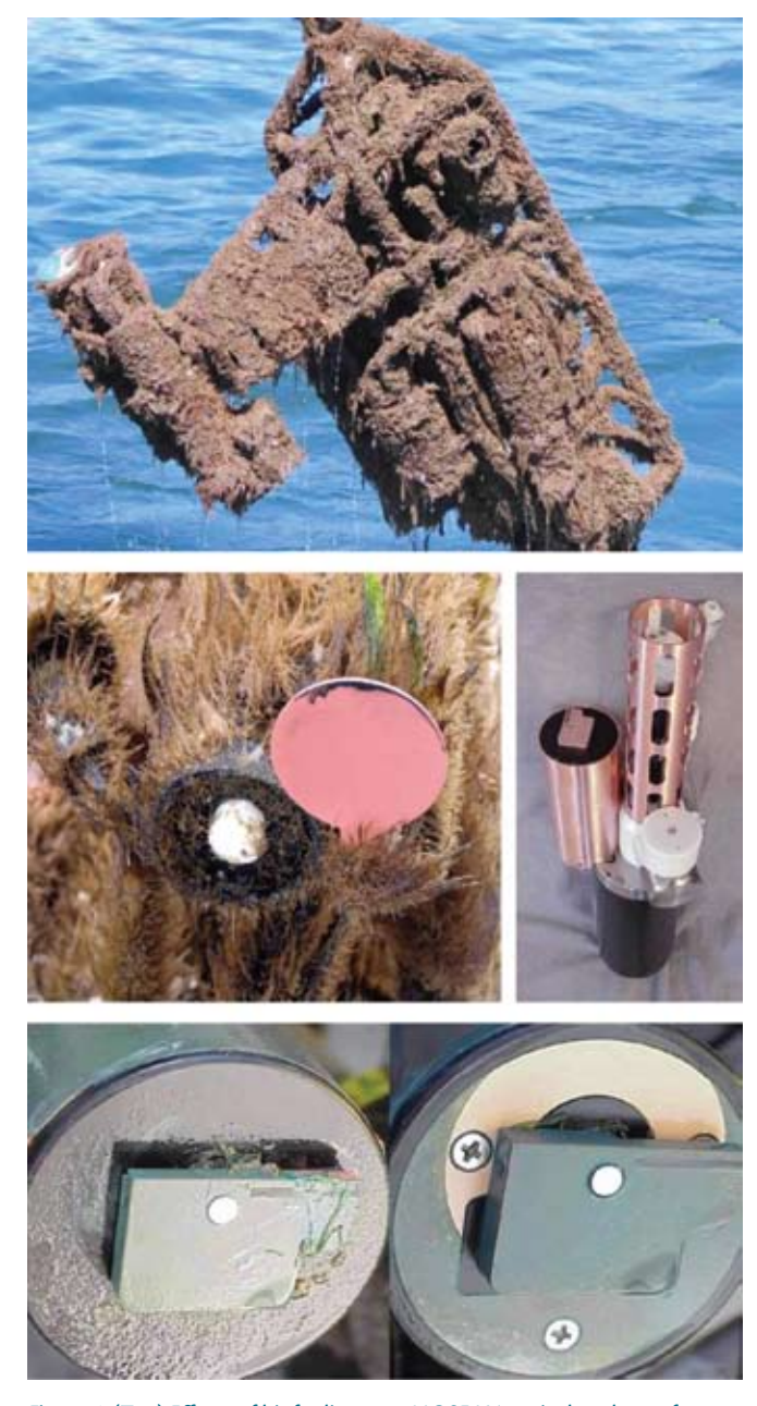
Figure 4. (Top) Effects of biofouling on a MOSEAN optical package after long-term deployment off the coast of California. (Middle left) Optical sensor and copper shutter system used to mitigate the effects of biofouling. (Middle right) The WET Labs WQM system equipped with special antibiofouling devices. (Bottom) Copper shutter systems designed and tested during the present NOPP projects to mitigate the effects of biofouling.

shutter is designed to open just prior to sampling and then re-close following measurement collection. The anti-fouling shutter technology has continued to be developed and improved and has