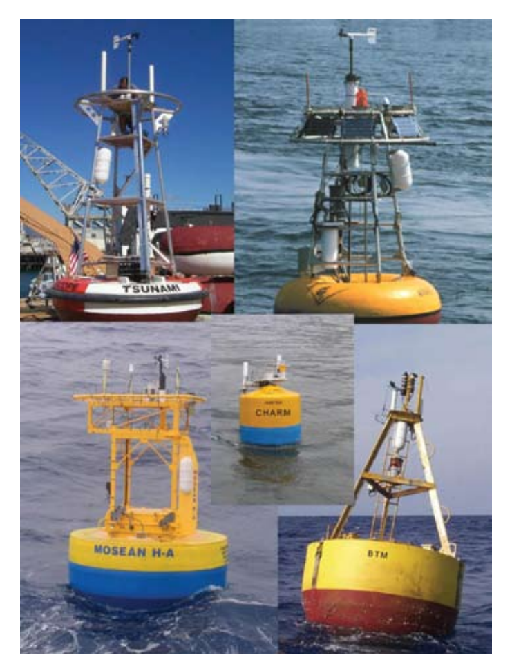
Figure 1. Photographs of buoys used during the NOPP O-SCOPE and MOSEAN programs. (Upper left) NOAA tsunami buoy deployed at Ocean Weather Station "P". (Upper right) MBARI M2 buoy off the Monterey, CA, coast. (Lower left) MOSEAN H-A buoy near the Hawaii Ocean Time-series (HOT) site north of Oahu, HI. (Lower right) Bermuda Testbed Mooring (BTM) buoy near the Bermuda Atlantic Time Series (BATS) site. (Center) MOSEAN CHARM buoy off La Conchita, CA.

An autonomous, in situ instrument called the Spectrophotometric Elemental Analysis System (SEAS; see Figure 2; Byrne et al., 1999, 2002; Kaltenbacher et al., 2001) was continually improved and tested under the auspices of O-SCOPE (Robert Byrne, University of South Florida. Note: The names in parentheses in this article indicate principal investigators or those most responsible for the aspect of the research being