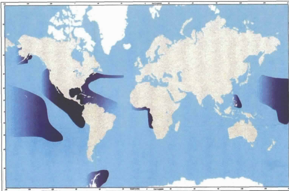
Figure 1. The extent of the oceans once surveyed by the National Marine Fisheries Service.